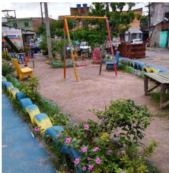
Figure 8. The Water Drop plaza in Iputinga, which residents built largely by themselves amid construction delays.

In Iputinga, despite its initial difficulties in winning residents' support for projects aimed primarily at young children, ARIES got a pleasant surprise. After various factors held up construction of the smaller of the two plazas there, known in the neighborhood as the Water Drop because of its tearlike shape, the residents—now eager for the improvements—began, unprompted, to build the park on their own. They made a border for the periphery with brightly painted old tires and empty soft-drink bottles; built benches, chairs, and a table; donated plants; and put up a homemade sign forbidding the use of the park's waste can for household garbage (figure 8). Souto said that when one of the residents ignored the warning, neighbors deposited the trash back on that resident's