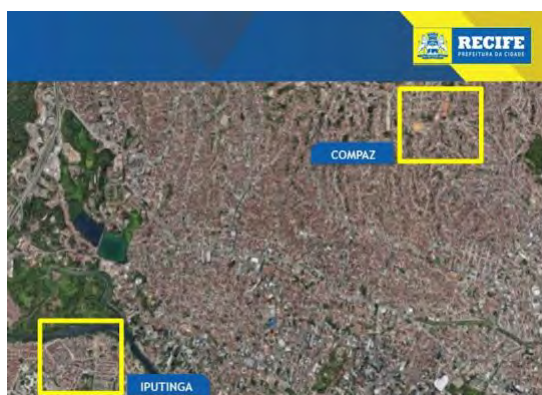
Figure 6: COMPAZ Alto Santa Terezinha and Iputinga.

In short order, the city decided to add a pilot site in the Alto Santa Terezinha neighborhood, where ARIES had already started to build a relationship with the city's first COMPAZ center (figure 6). Recife's COMPAZ