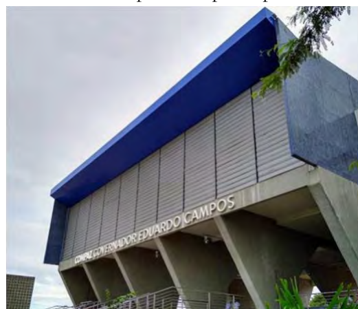
Figure 7: COMPAZ Center, Alto Santa Terezinha.