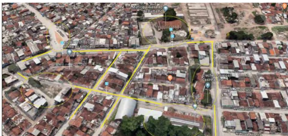
Figure 5: Intervention areas in Ipatinga. Circled areas on right are schools. Circled areas on left are plazas. Connecting routes are shown in yellow.