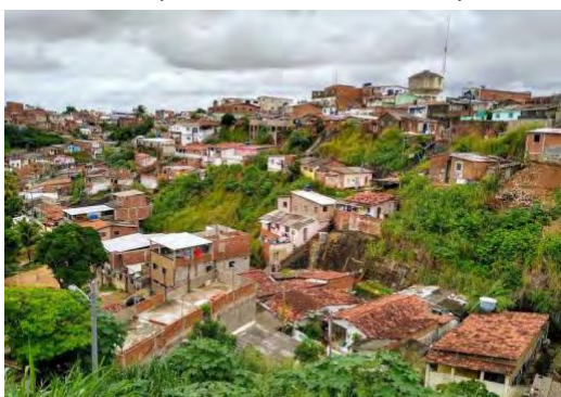
Figure 2: Hillside neighborhood of Alto Santa Terezinha.

First, questions of scope and cost arose from the geographies of the neighborhoods in Recife where children faced the sort of difficult conditions that the mayor's new focus on early childhood sought to address. The municipal