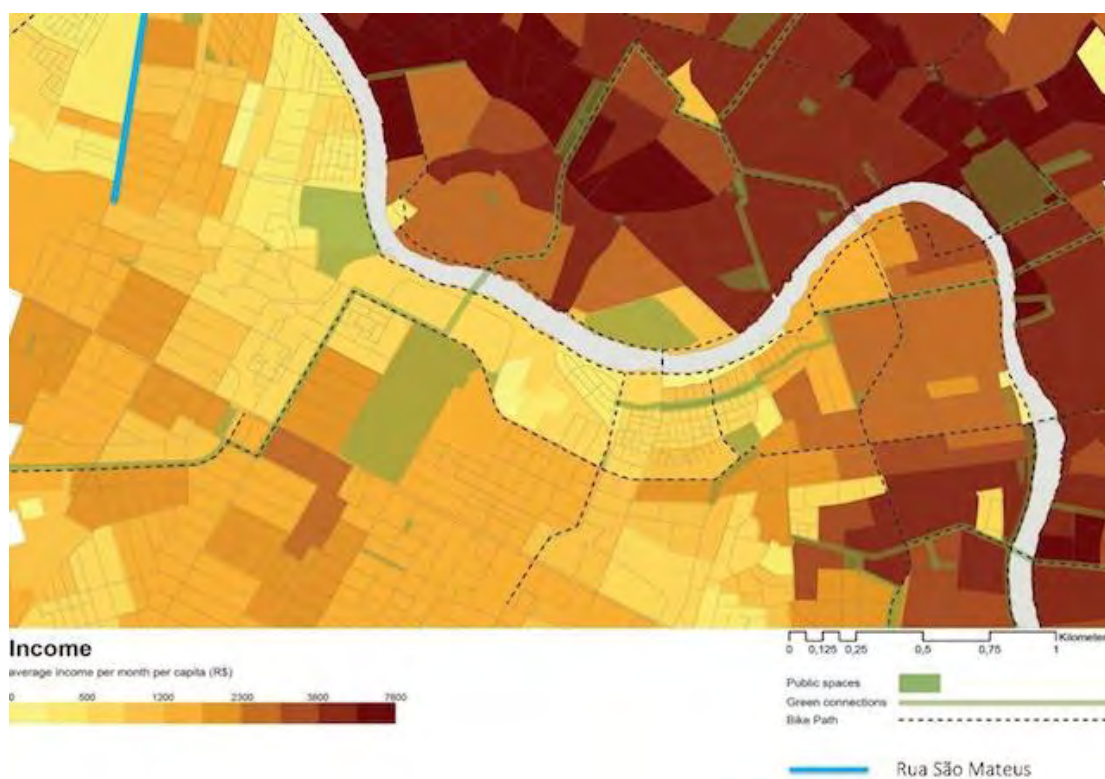
Figure 4. Income distribution of Ipatinga and surrounding area.

The management team sought to apply Urban95 principles, including the idea of establishing children’s priority zones geared to the needs of young children and their families. The team designed a pilot project that would test how to best create safer routes for young children and their parents to reach essential services; provide open spaces for children to encounter nature and engage in unstructured play; and link caregivers to programs aimed at strengthening the ties between children and their parents—all key elements of the concept. If the pilot succeeded, the city could adapt the idea to other low-income neighborhoods with similar needs and, ultimately, implement the Urban95 principles citywide.