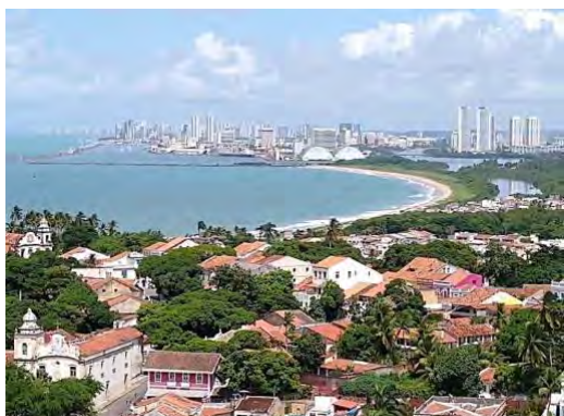
Figure 1: Recife from neighboring Olinda.

Geraldo Julio won Recife's 2012 mayoral election on a platform that promised to make the city a more modern, comfortable, and equitable place to live. A medical and tech hub and popular tourist destination on Brazil's Atlantic coast, Recife had one of the highest levels of income inequality in the country. 1 Although the proportion of the city's 1.6 million residents living below the poverty line had dropped by half during the previous decade, it hovered at 16.5%. Recife's favelas, where many poorer families lived, included clusters of densely packed shanty villages on hillsides and riverbanks that had developed in the absence of government regulation. The crime rates in the favelas contributed to Recife's ranking as the world's 22nd-most-dangerous city, with 55 homicides per 100,000 people in 2017. 2 Improving the life chances of young people in these areas was difficult (figure 1).