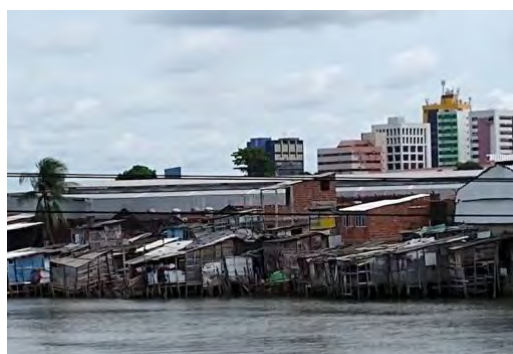
Figure 3: Riverside community of stilt houses in Recife.