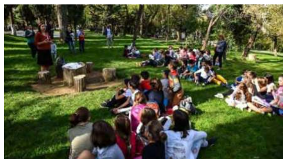
Figure 3: Grand Lake Park Credits: City of Tirana, Startek Constructions , Visit-Tirana.com