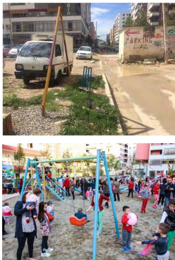
Figure 4: Before & After

The parks agency inherited more than a hundred groundskeepers from the former greening division and added a couple dozen designers, landscapers, architects, and engineers. Crucial volunteer technical assistance came from Darell Hammond, an American fortuitously living in Tirana. Hammond had founded and led an American nonprofit called KaBOOM! which helped build thousands of playgrounds across North America, pioneering a