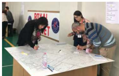
Figure 1: ITC workshop

Over a series of mornings in early 2019, city planners, architects, engineers, and other municipal officers met in the gymnasium of a newly renovated school to rethink their city—Tirana, Albania—through the eyes of a child. Gathered around tables laid with scale maps of two primary schools and their environs, the group sketched out plans to make the city’s neighborhoods safer, healthier, and more comfortable for infants, toddlers, and caregivers. Where would benches and trees best provide for shady rest or snack breaks? Was it possible to calm the traffic? to lessen noise? to reduce danger? What kinds of objects or terrain would prompt children to think and to play? (Figure 1)