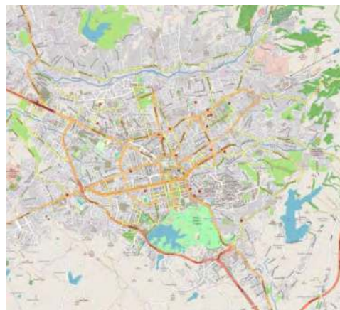
Figure 2: Tirana streets map, Credit: openstreetmap.org

After a quarter century of unplanned growth, Tirana had overcrowded schools, overgrown parks, crumbling sidewalks, and congested streets. (Figure 2) Children generally played in the streets or in private playgrounds in cafés and shopping malls. A 2018 survey of parents of preschoolers, conducted by Qendra Marrëdhënie, a nonprofit based in Tirana, found that although 62% of respondents preferred that their children play in parks and playgrounds, only 7% lived close to such public spaces. 1