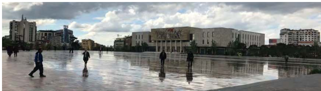
Figure 5: Skanderbeg Square

“In the morning, it was a complete PR disaster,” he said. Driver complaints about the rerouting overwhelmed the communications team. But the children