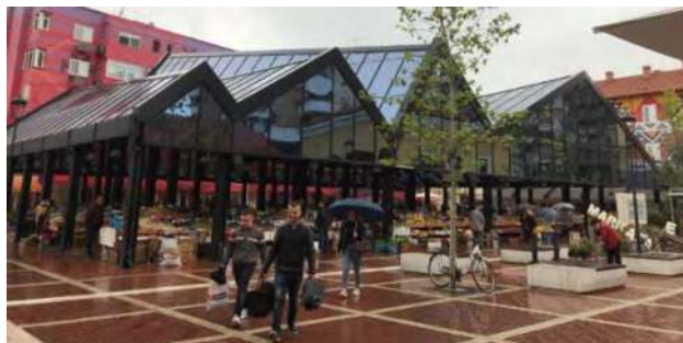
Figure 6: New Bazaar

In 2016, the city renovated and pedestrianized Pazari i Ri—the New Bazaar—a farmers market built in 1931 that anchored one of Tirana’s oldest neighborhoods. The redevelopment added seating and public art to attract local families and tourists to the area’s shops, cafés, and eateries (figure 6).