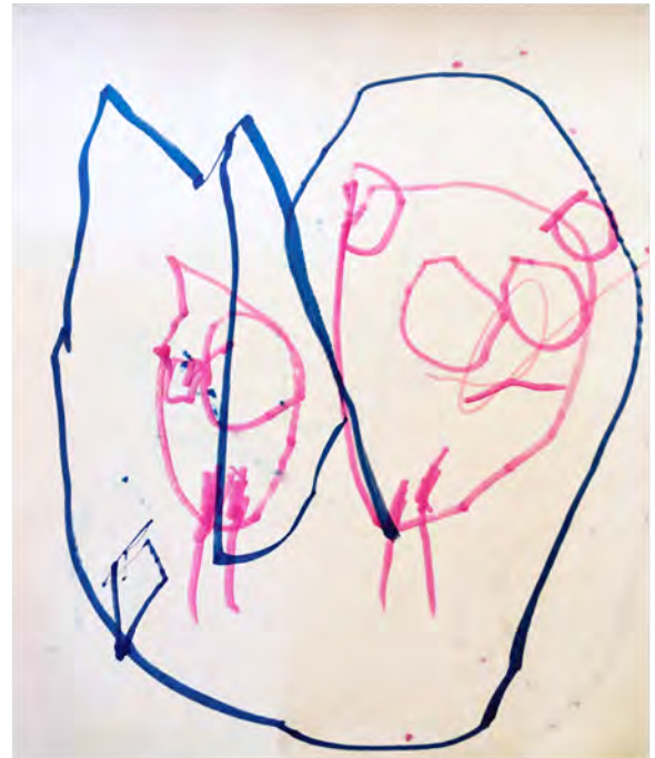
“A Mommy and Baby Singing Together” drawn by a 3-year-old artist during a singing workshop

Finally, at this age, active music making (singing, clapping, etc.), as compared to passive listening, facilitates enculturation into culturally specific tonal systems of music (Trainor, Marie, Gerry, Whiskin, & Unrau, 2012). This suggests that as early as the first year of life children begin to pick up not only the sounds of their native languages but also the characteristics of the musical systems that surround them. Older infants’ abilities to make proto-linguistic gestures and sounds in response to musical events mean they can begin to participate in cultural events outside the home, bobbing to music, laughing and smiling at bursts of sound, and joining in clapping. In arms or up on a parents’ shoulders, they can join in, amplifying a family’s belonging and certifying that there is a next generation to hear beloved songs and stories.