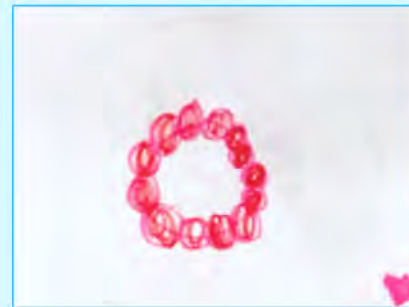
One 4-year-old’s drawings of the structure and the instruments she wants to build.