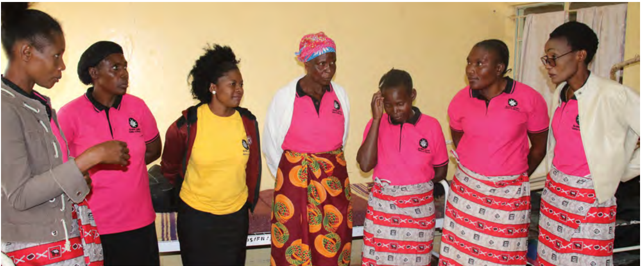
Kayosha lullaby volunteers rehearsing

As a health intervention, songs and singing have known benefits (e.g. self-regulation, bonding with others, communicative development), coupled with zero cost and total portability. Building on this knowledge, a team of researchers joined with local health workers in Zambia to bring down the high levels of maternal and infant mortality, especially among young mothers. Given high levels of poverty, their search was for a zero-cost intervention (Radjou & Prabhu, 2015) that built on local practices and materials. Their approach was simple, flexible, and well suited to a country that is resource-poor and musically rich. Starting in 2019, the researchers (David Swann, James Reid, and Barry Doyle) worked with local partners at St. Johns Zambia to think through the ways in which music could help to deliver sustainable and scalable maternal and child health care strategies. The team used creative workshops to capture “day in the life” activities, social networks of care in local communities, and identified critical well-being messages that pregnant adolescents needed: maternal nutrition, APGAR warning signs in a sick infant, and more. Volunteer clinic workers, many of whom were mothers and respected elders, composed songs carrying these potentially life-saving messages which are increasingly an integral part of pre-natal care visits (Reid & Swann, 2019).